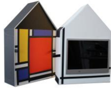
Memento Mori - H:42xW:30xD:12 cm-2019-one copy box with front and screen inside the white box

Memento Mori - H:42xW:30xD:12 cm – 2016 - one copy.